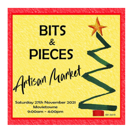
Bits & Pieces Artisan Market

Event - Bits & Pieces Artisan Market 2022