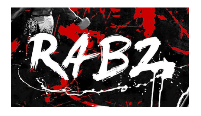
RABZ Fight Promotions

Event - Bits & Pieces Artisan Market 2022